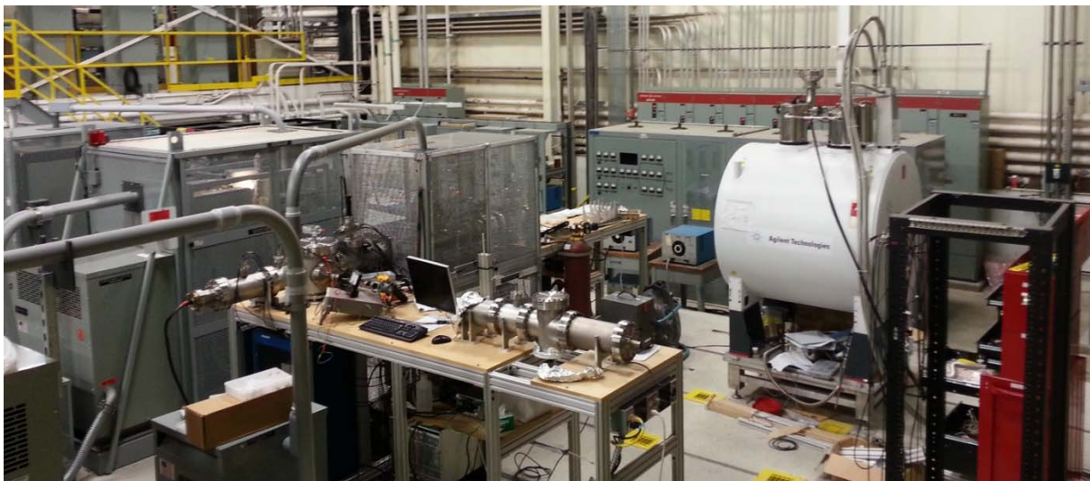
FIG. 1. The TAMUTRAP facility as of 4/16/13

Over the past year, significant progress has been made toward the commissioning TAMUTRAP (Fig. 1). The geometry for the large, open-access Penning trap has been finalized and shown to be theoretically competitive with traps employed in other prominent facilities [1]. Critical systems such as the high voltage platform, power supplies, radio frequency (RF) voltage systems, and gas pressure controls for various beam line elements have been commissioned. Testing of several meters of beamline as well as the RFQ Paul trap used to bunch the incoming beam and lower emittance has begun with an offline ion source, and beam transmission through these elements has been confirmed. Additional beam optics have been fabricated and are currently being tested.