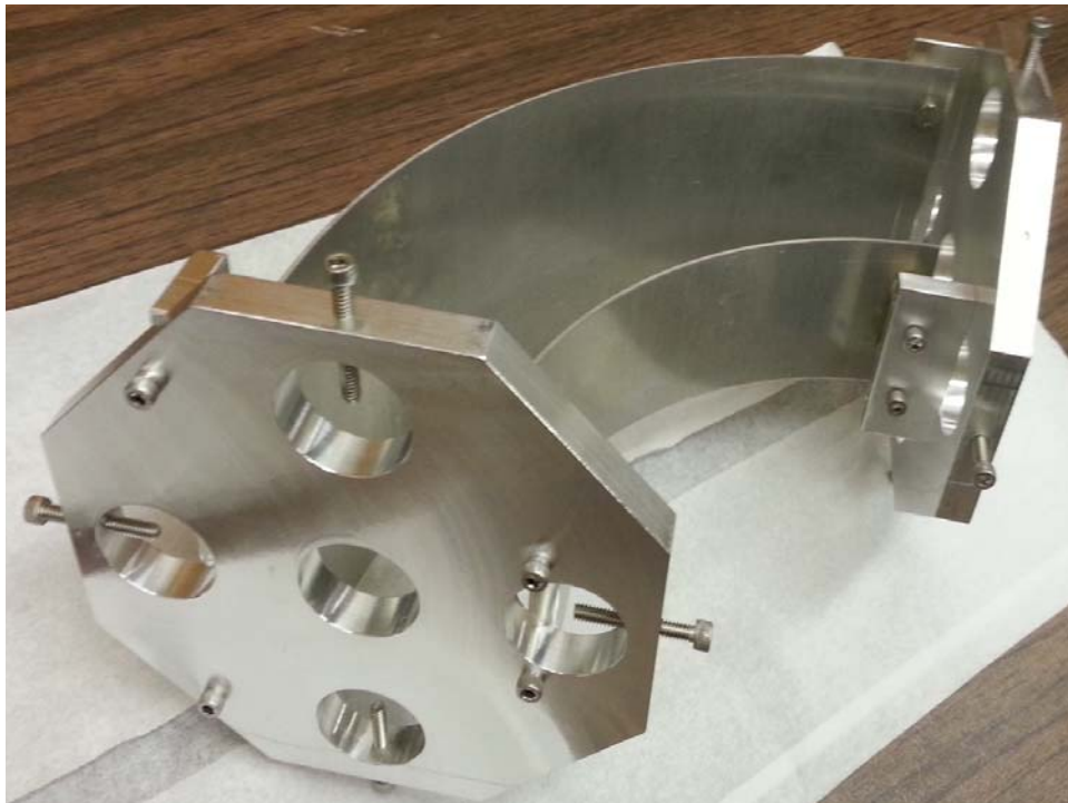
FIG. 3. The cylindrical ninety degree deflector currently awaiting testing.

Concurrent with the testing of the beam line and RFQ, additional beam optics and equipment to be needed later in the assembly of the facility were being fabricated and assembled. The beam optics on this list include the spherical deflector needed to bend the beam ninety degrees, a prototype cylindrical deflector (Fig. 3) that could be used for the same purpose (upcoming testing will indicate if its performance is satisfactory), and a pulsing cavity used to lower the beam energy for loading into the measurement trap. The cylindrical deflector is the first of these elements to be completed, and is currently awaiting testing.